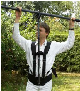
Strong Belt + harness (optional)